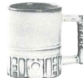
*C-4 -12 Oz. Coffee Mug 1.50