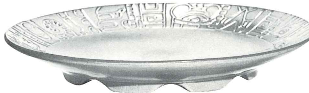
7FC-15" CHOP PLATE—10.00