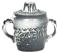
7B-SUGAR WITH LID—2.25