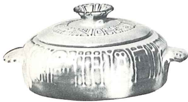
7V-2 QT. BAKER/BEAN POT—5.00