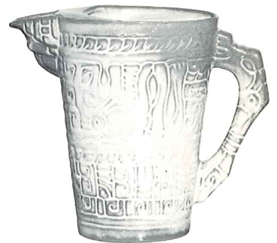
*7D-2 QT. PITCHER—5.00