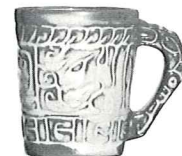
*7CL-8 oz. MUG—1.50