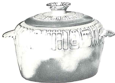
7W-3 QT. BAKER/BEAN POT—6.50