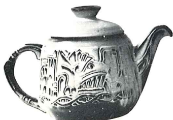
*7T-6 CUP TEAPOT—4.50