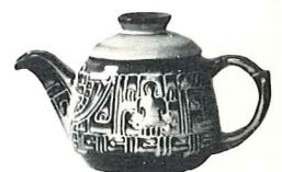
*7J-2 CUP TEAPOT—3.00