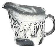
7A-6 OZ. CREAMER—1.75