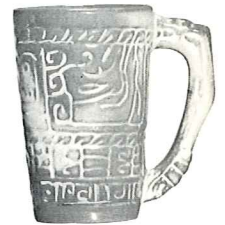
*7M-14 OZ. MUG—2.00