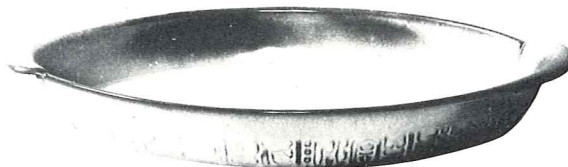
7Q-13" DEEP PLATTER—4.00