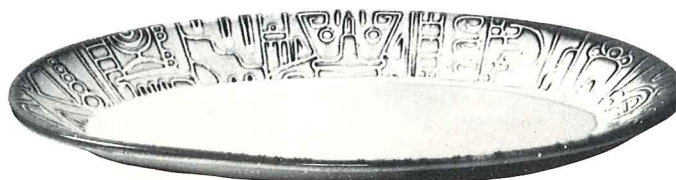
7TP-17" AZTEC OVAL PLATTER—10.00